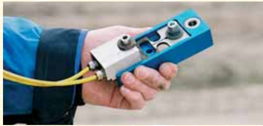
Combined strain-acceleration transducer