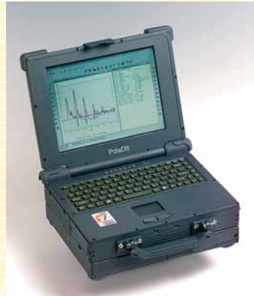
PDA/DLT monitoring system

The PDA/DLT system, which is used both for PDA and DLT, operates under a Windows environment and consists of a monitoring system with a hard disk, signal conditioning, combined sensors for strain and acceleration and cables. The PDA/DLT software for monitoring and reporting includes many features to further facilitate signal processing and interpretation.