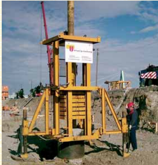
Dynamic load testing in the field

Dynamic Load Testing (DLT) is a quick method to evaluate the bearing capacity of a pile for loads similar to the design load. It can be used for prefabricated piles, cast-in-place concrete piles, steel piles and wooden piles. DLT is considerably faster than static tests and at a fraction of the cost.